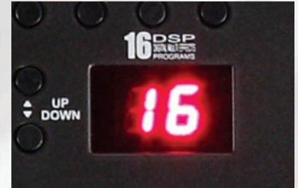
16 Digital Multi Effects