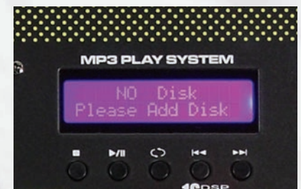
USB / SD MP3 Playback