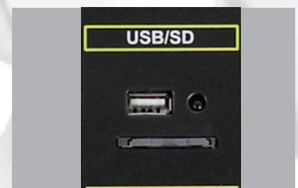
USB / SD Card Slot